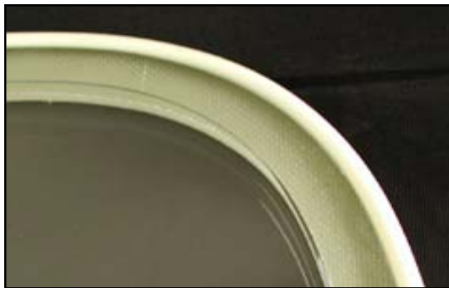
CROSS SECTION OF PERKINS LAMINATED WINDOW

Perkins Aircraft Windows is proud to announce the latest improvement to our already superior Hawker laminated cabin windows. In 1994, Perkins Aircraft invented and introduced the single pane laminated cabin window in an effort to permanently eliminate the need to remove and overhaul the original design window due to dirt, fogging and white line separation problems.